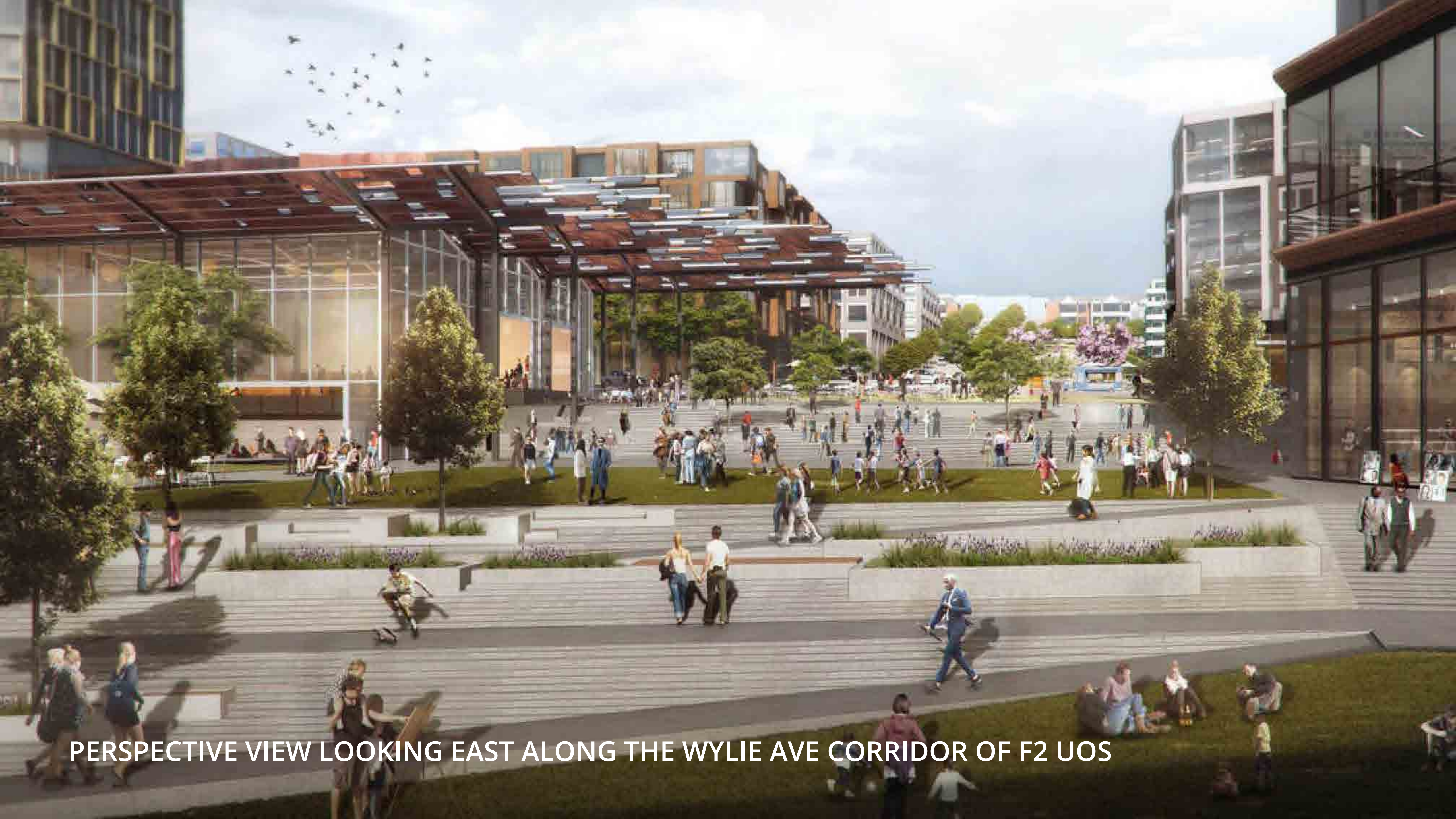
PERSPECTIVE VIEW LOOKING EAST ALONG THE WYLIE AVE CORRIDOR OF F2 UOS